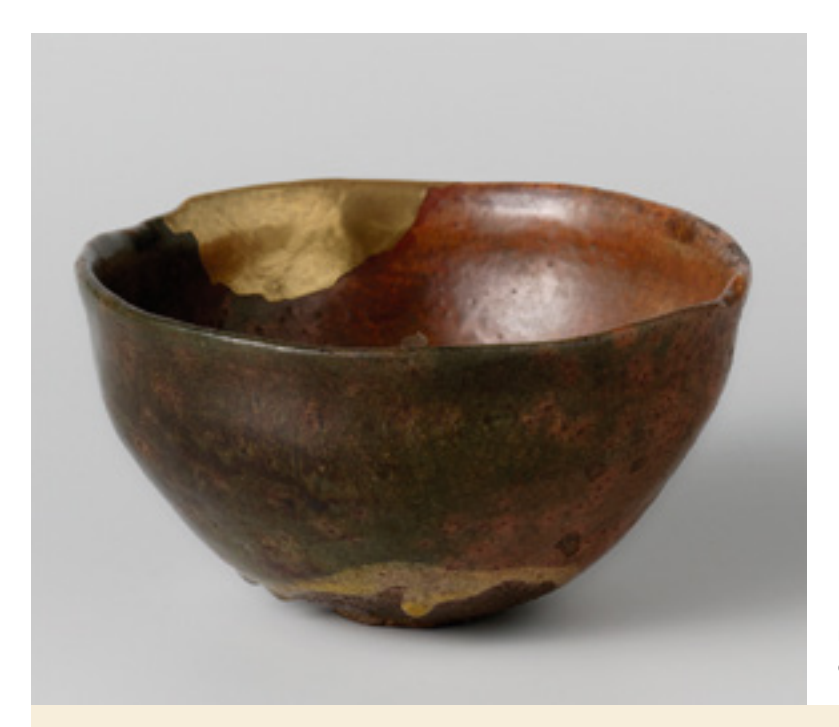
Raku bowl, maker unknown, stoneware, ca. 1650 - ca. 1750