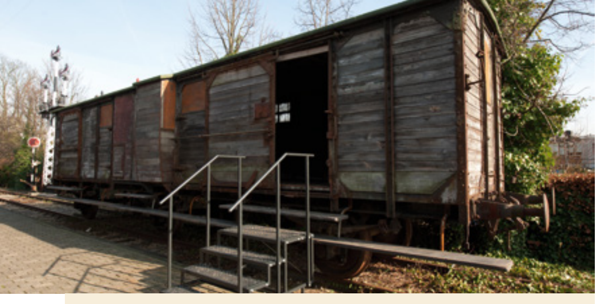
The NS D 4088 baggage car is part of permanent 'Laden trains' exhibition at the Dutch Railway Museum.