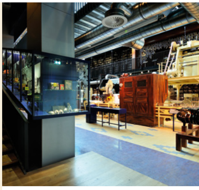
The Verkade Pavilion at the Zaans Museum attracts large numbers of visitors

Until a few years ago, the Foundation for the Preservation of Verkade's Cultural Heritage managed an extensive and varied collection on the history of Verkade, a family company headquartered in Zaandam. The Foundation's board, who felt that the Verkade legacy should be made accessible to the general public, strongly advocated a museum presentation. In 2009 the Zaans Museum took over the collection and built a separate pavilion for it. This was a fascinating supplement to the museum's collection, as the Verkade story fitted perfectly within the context of the Zaanstreek as a major industrial area. The Verkade pavilion, complete with a full chocolate-production line, proved a huge drawcard. As well as a high perception value, the Verkade collection has a high economic value. Since the addition of the Verkade pavilion, the number of visitors has jumped from 23,000 to 60,000 per year.