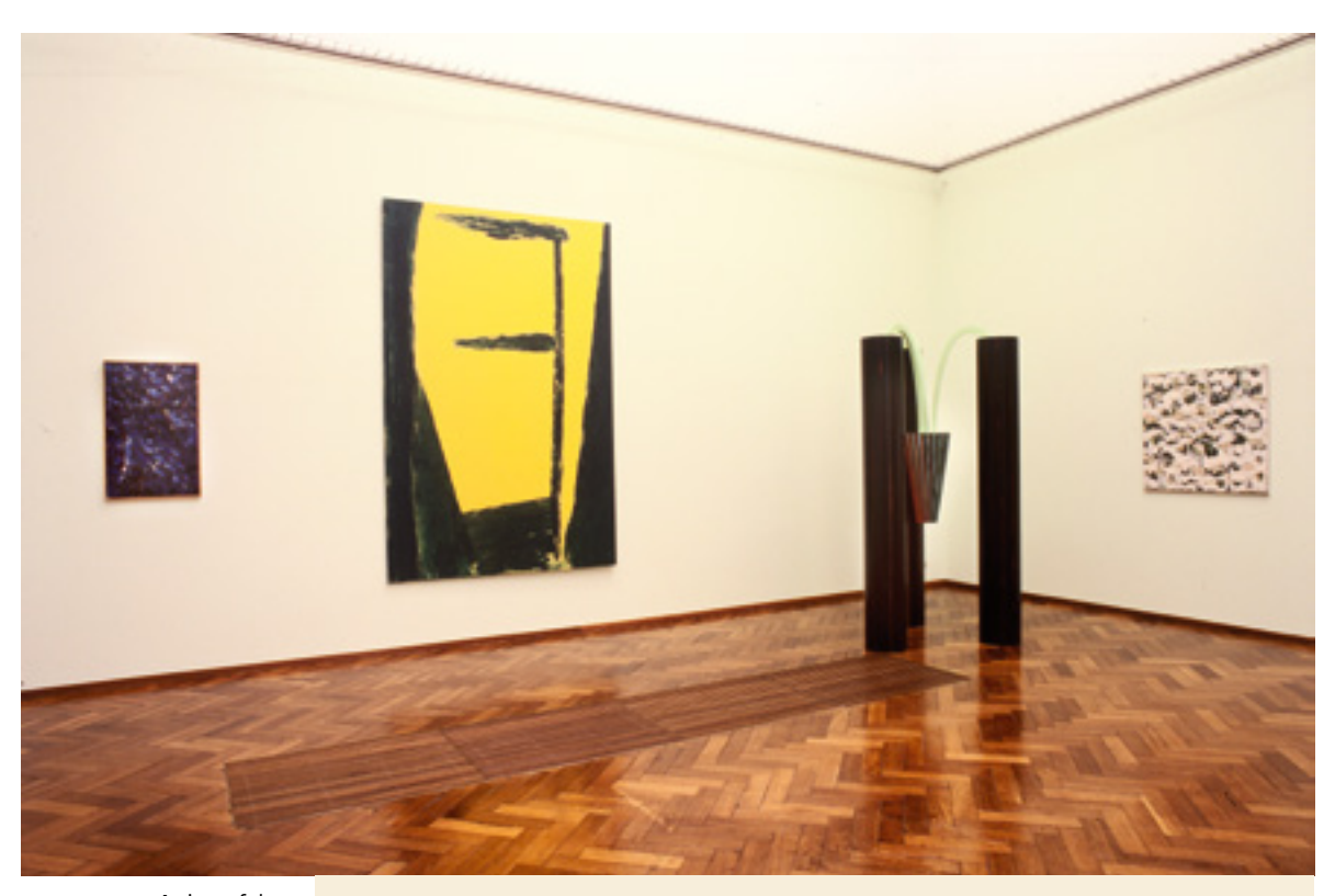
A view of the 'The Presentation', an exhibition put together by Queen Beatrix in the Stedelijk Museum.