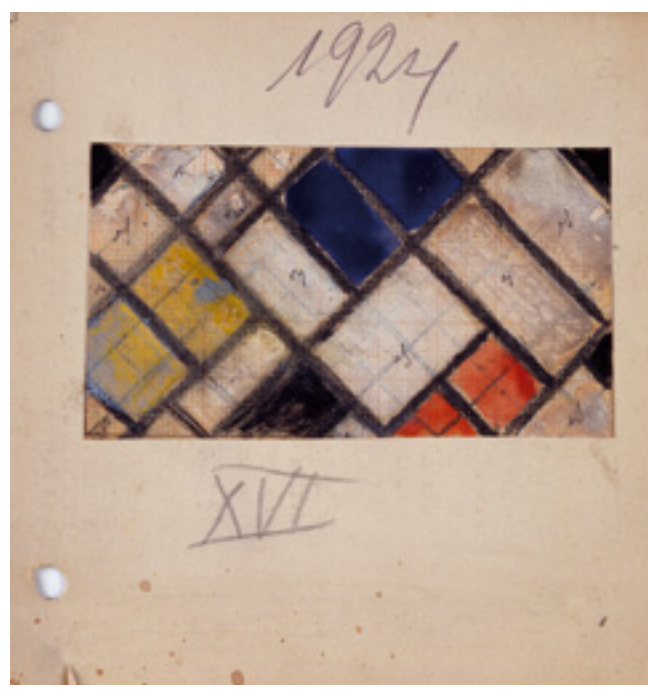
Study for Counter-composition XVI, Theo van Doesburg, pencil, gouache, paper, 5 x 9 cm, 1924

scientific value, research value, documentation value, reference value, archival value