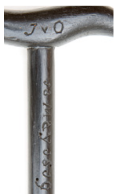
Detail of the walking cane with Johan van Oldenbarnevelt's initials, Museum Flehite, Amersfoort.