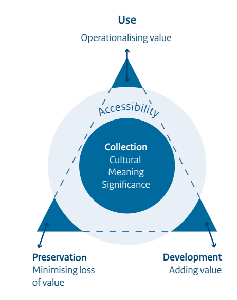
Figure 1. The collection management triangle

accessibility is vital in all of this. If you can't access the items, you can't do anything with them. This applies to both physical and virtual access (e.g. digitised photos on the internet) and to the knowledge associated with an item. Value therefore plays a greater or lesser role in all collection management activities. In fact, collection management is all about 'managing values'. Most important of all is articulating and communicating why items and collections are significant.